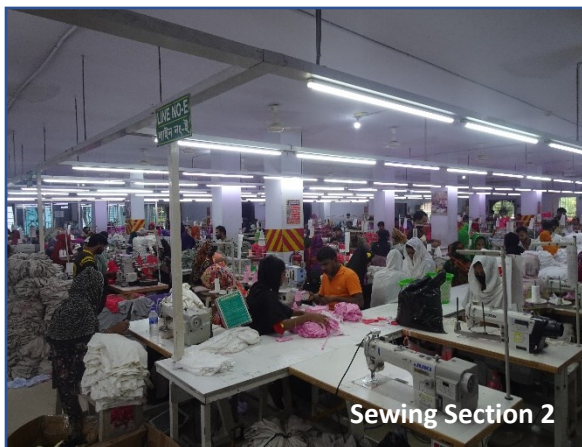
Sewing Section 2