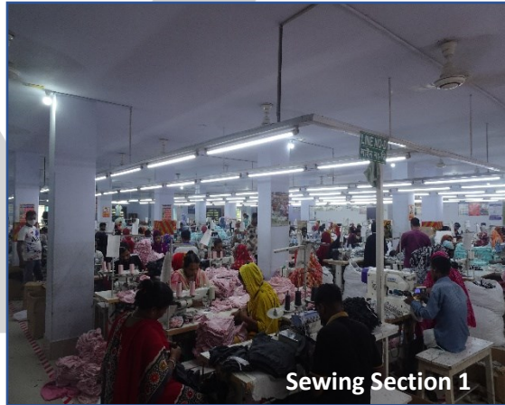
Sewing Section 1