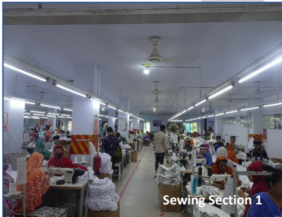
Sewing Section 1