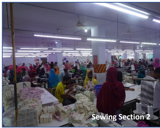
Sewing Section 2